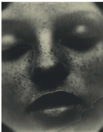
The ghost-vague face of one of Mann's children seems to recede into oblivion. Right, an arrangement of bones from her dog Eva's unearthed skeleton.

Mann's buildings look as if they were photographed only hours before they burned down. Pillars rise from plantation ruins with Lost Cause self-satisfaction. In Mann's scandalous 1992 photographs of her own naked, wounded, sexy, beautiful, tired and dirty children, there's corruption, but it's nothing more than a sort of moral twilight. One feels a slight shudder at the scent of evil, the Beast himself about to wake from a nap in the late afternoon woods.