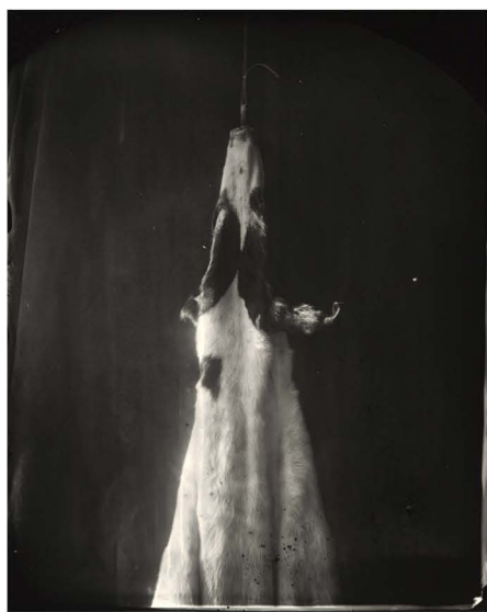
The hide of Mann's dog Eva, removed by a taxidermist. Right, a body decomposes at a University of Tennessee forensic research center. Below, one of Mann's now-grown children, who were once the focus of her art.

Let's hope so. The show is so powerful you want to love it, particularly when you see the bedrock compositions of the Antietam battlefield photographs, which are in-